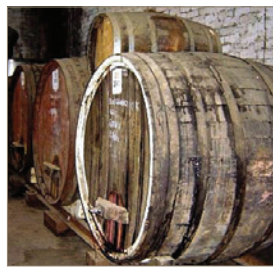
Chambers Barrel Room, Rutherglen