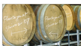
Plantagenet Estate Barrel Hall, Great Southern