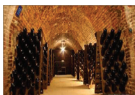
A look inside Champagne Collet's 100-year-old chalk cellars

CHATEAU de SOURS Reserve de Sours Sparkling Rosé Bordeaux $20