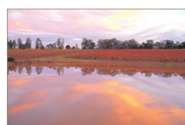
Sunset at Brokenwood, Hunter Valley