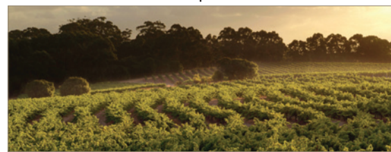
Leeuwin Estate Vineyard, Margaret River

GIANT STEPS Yarra Valley Chardonnay Yarra Valley $30