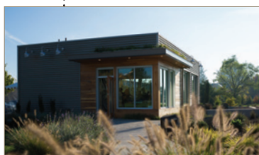
Chapter 24 Vineyards' Tasting Room in Dundee, Oregon

CLOS DU VAL Estate Pinot Noir Carneros, Napa Valley $40