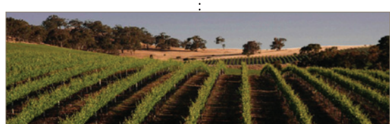
Kilikanoon Vineyard, Clare Valley