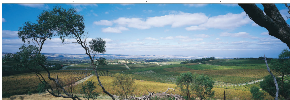
d'Arenberg Vineyards, McLaren Vale