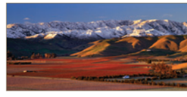
Upper Brancott Valley vineyards selected by Greywacke

GREYWACKE Wild Sauvignon Marlborough $29