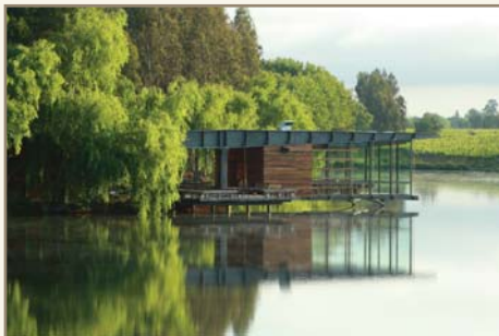
The scenic view of the tasting room overlooking the lagoon.