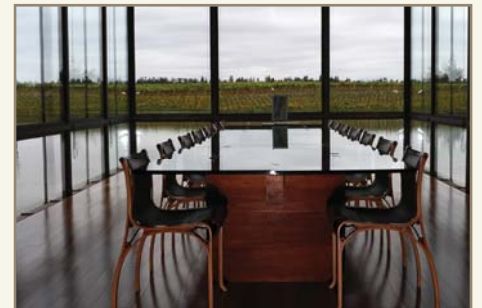
Interior of the Chilensis tasting room