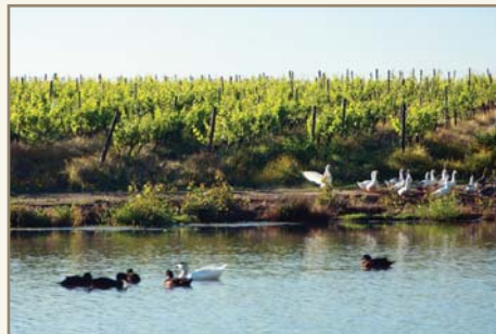
Chilensis' commitment to farming sustainably includes encouraging the surrounding natural habitat to thrive.