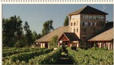
The San Rafael Estate in Chile's Maule Valley.