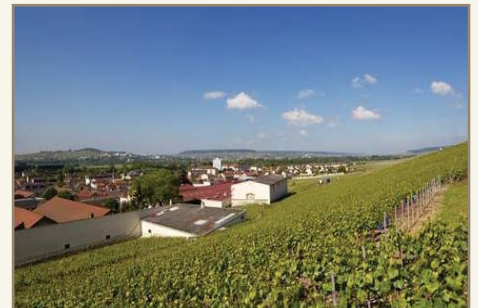
Century old vines surround Champagne Collet in the Grand Cru village of Aÿ.