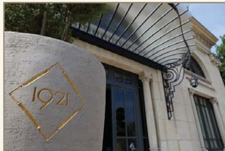
The Art Deco inspired entrance to La Villa Collet. Inside, visitors are extended a cultural journey into this famous era.