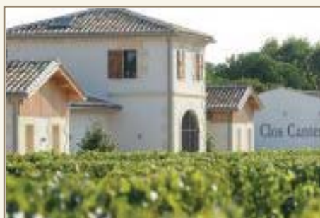
The newly renovated Clos Cantenac winery