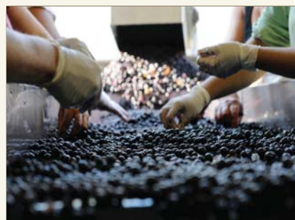
The sorting table in action