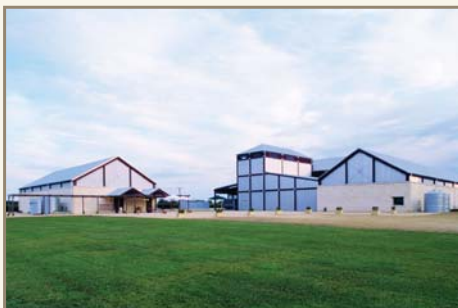
Penley Estate's modern winemaking facility