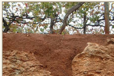
Terra Rossa soils