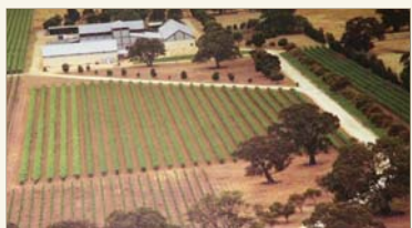
Penley Estate’s vineyards among the flat, expansive plains of Coonawarra.