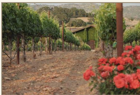
Hironnelle Vineyard, Stags Leap District