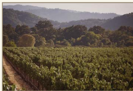
State Lane Vineyard, Yountville