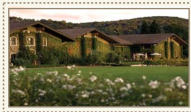
Clos du Val Winery in Stags Leap District, Napa Valley