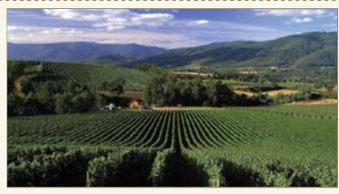
The lush, rolling vineyards of Yarra Valley.