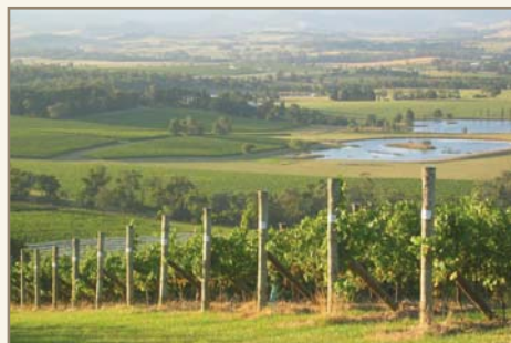
The scenic view of Giant Steps vineyards in the Yarra Valley