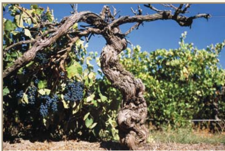
The famous Dead Arm Shiraz vine