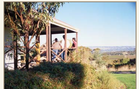
d'Arenberg's McLaren Vale tasting room