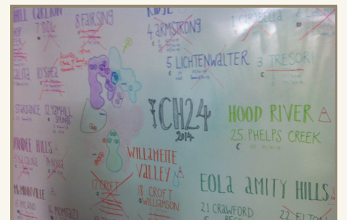
The white board harvest tracker