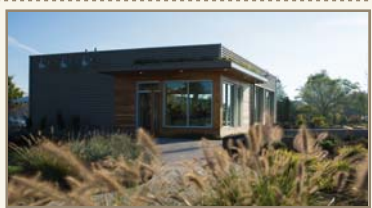
Chapter 24's modern tasting room in Dundee