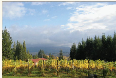
view in Yamhill-Carlton, Willamette Valley