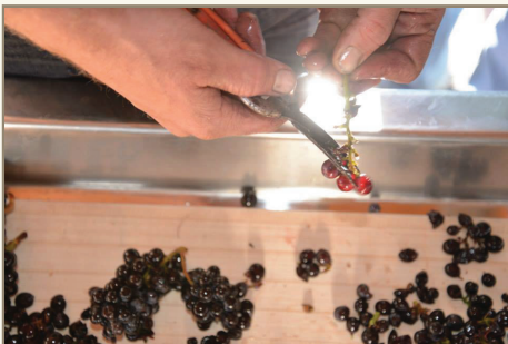
De-stemming on the sorting table at the winery