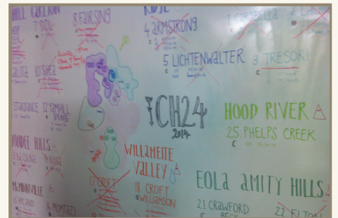
The white board harvest tracker