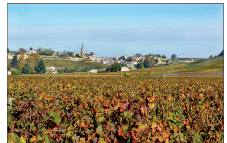
Vineyards overlooking the town of St. Emilion