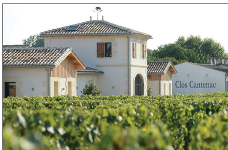
The newly renovated Clos Cantenac winery

WINEMAKING: Through good practice and common sense, Clos Cantenac is careful to respect the history and tradition of the region whilst recognizing the changing growing conditions of each new vintage, and adapting its work to produce wines that also reflect the skill and passion of its team. When harvested, our grapes are delivered in whole bunches from small baskets and carefully assessed on a first sorting table before de-stemming. The fruit is then checked again on a second table, before being passed gently into steel tanks and barrels. The fruit immediately undergo a cold maceration for five to seven days to develop fruit aromas prior to fermentation. After fermentation is complete, the wines undergo a ten day maceration period to refine the tannins, followed by malolactic fermentation before transferring to French oak barrels for 18 months of aging before bottling. In 2014, the winery will complete the rebuilding of a stone wall around the cellar, barrel hall and vineyards that sit immediately by the cellar, creating a proper 'clos' once again.