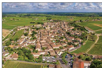
Aerial view of Saint-Emilion