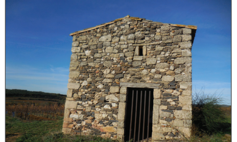
Le Mazet du Domaine de Nizas