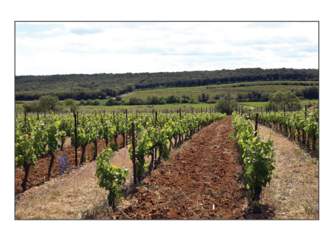
Beautiful Pézenas landscape showcased by Domaine de Nizas' Mourvedre vines