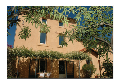
Domaine de Nizas estate