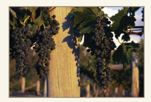
Spicy Shiraz grapes ripen on the vine