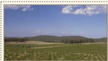
Jasper Hill's sprawling dry farmed vineyards under a clear blue sky