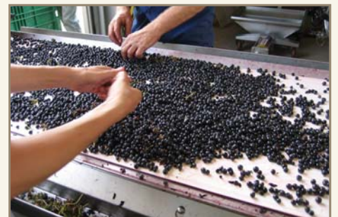
The Laughtons at Jasper Hill's sorting table