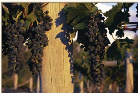
Spicy Shiraz grapes ripen on the vine