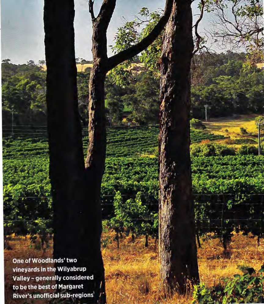
One of Woodlands' two vineyards in the Wilyabrup Valley – generally considered to be the best of Margaret River's unofficial sub-regions