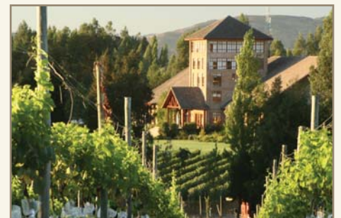
The Bodega at the beautiful San Rafael Estate