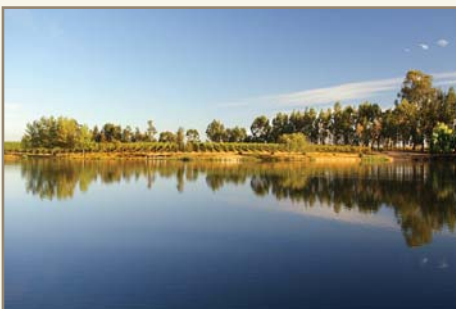
The scenic view of the lagoon at the San Rafael Estate Vineyard in the heart of the Maule Valley