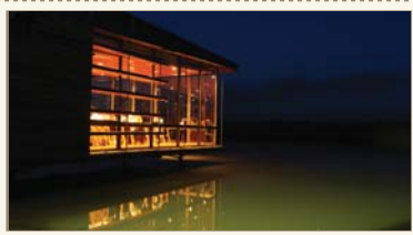
The Oveja Negra tasting room in Maule Valley by night.