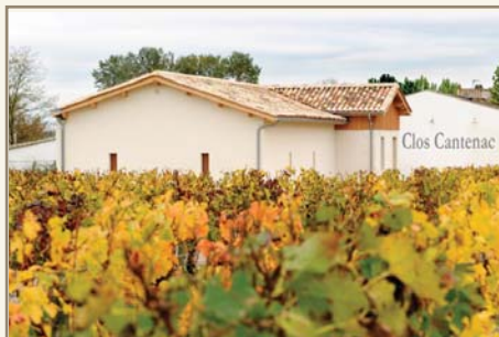
The newly renovated Clos Cantenac cellar