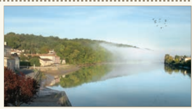
The Clos Cantenac estate in Saint-Emilion