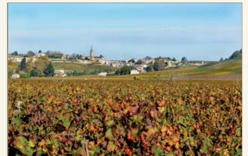
Vineyards overlooking the town of St. Emilion