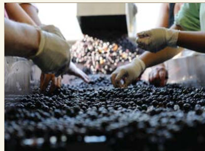
Vineyard workers hand sorting just-picked grapes