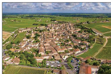
Aerial view of Saint-Emilion