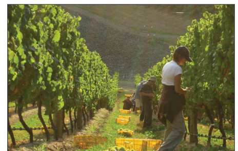
Steep vineyards are hand-picked by local workers