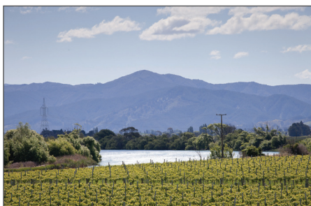
Wairau Bar Vineyard nestled by the sea in Central Otago

WINEMAKING: Winemaking is carried out at Innocent Bystander's modern artisanal winery, a facility designed for hand-crafting small, individual batches of wine with a natural winemaking philosophy, whilst making quality the priority. Using 100% hand-picked fruit, wild ferments and gravity-flow winemaking techniques, the wines are made with minimal filtration and fining. Whole bunches, co-fermentation and hand-plunging aid integration in the Syrah, while the Pinot Noir fruit is treated to a three to five day cold soak and open vessel fermentation with small amounts of whole bunches to deliver lifted aromatics. The Pinot Gris is whole bunch pressed to retain delicacy, meanwhile oak maturation and lees stirring contributes complexity. These are wines from somewhere rather than anywhere - and they're determined not to take a back seat.