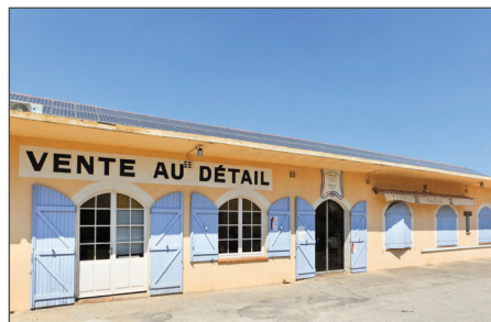
Cellier Saint-Sidoine in Puget-Ville