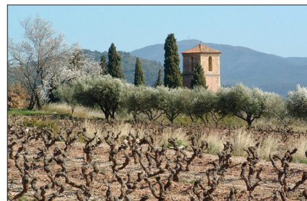
Even the off-season is beautiful in Provence