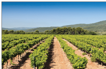
Grenache thriving in Puget-Ville

WINEMAKING: Coeur Clémentine uses traditional methods that have been carried down from for generations. A late night/early morning harvest is always practiced, when temperatures are coolest. Under the watchful eye of winemaker Jean Christophe Audéoud Coeur, Clémentine extracts the best part of the fruit at exactly the right time to maintain a balance between clarity, color and vibrant aromas. The grapes are gently pressed when still cool with minimal skin contact resulting in a lighter, dryer rose. Fermentations are kept cool and long to preserve the delicate floral and fruit flavors. For the sparkling wine, the still wine is then fermented slowly a second time to create the fine effervescence. The wine is left on secondary lees to build texture and palate weight before being bottled.