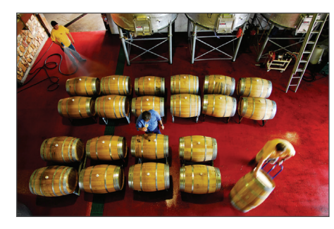
Cullen's small, biodynamically certified winery