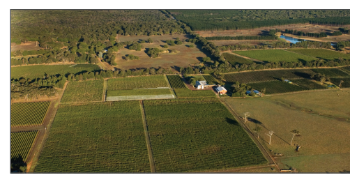
The Cullen vineyard, situated just two miles from the Indian Ocean