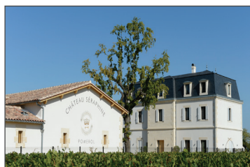
The chateau and winery