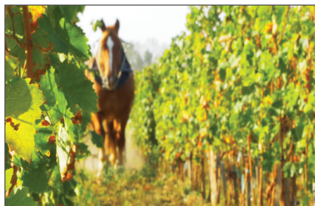
Low impact farming