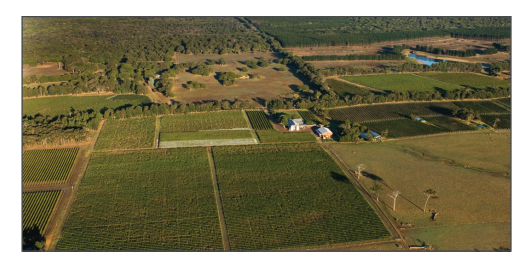
The Cullen vinevard, situated just two miles from the Indian Ocean