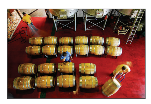
Cullen's small, biodynamically certified winery