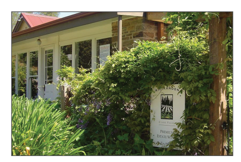
Kilikanoon's bucolic Cellar Door