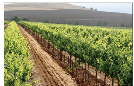
The Home Block situated in the heart of the Clare