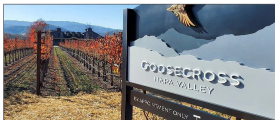
The Yountville estate in Napa Valley