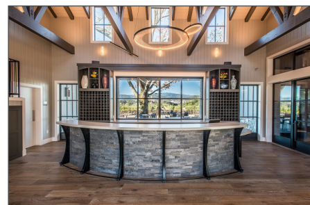
The tasting room overlooks estate vineyards and the Mayacamas mountains.