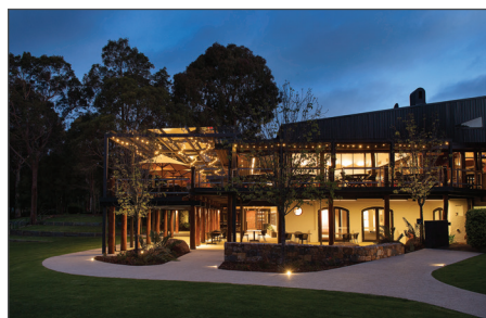
The award-winning tasting room and restaurant