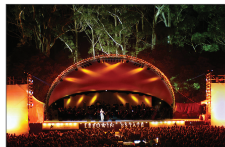
The Estate's annual concerts are legendary