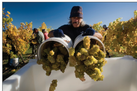
Hand harvesting in idyllic weather