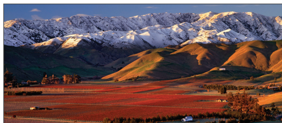
New Zealand's upper Brancott Valley vineyards