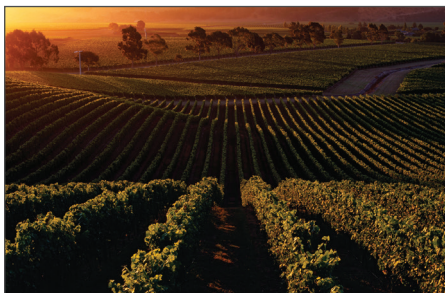
New Zealand's picturesque Yarrum Vineyard