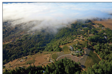
Cooling coastal fog; Kanzler sits just 8 miles from the coast.