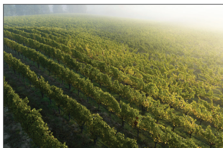
Pinot Noir vines planted in 1996.