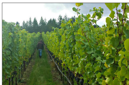
Willamette Valley, Oregon