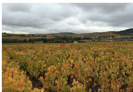
Moulin-à-Vent, Beaujolais, France